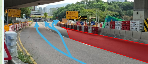
Temporary closure: Section of fast lane of Tai Po Road–Tai Wai (Eastbound)